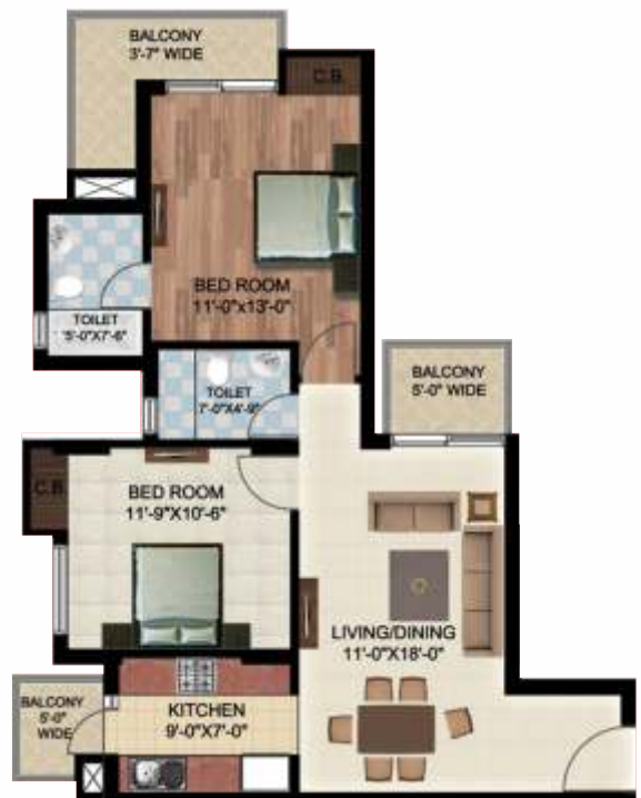
2BHK AREA 1075 SQ.FT TOWER E