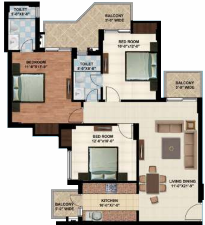
3BHK AREA 1400 SQ.FT TOWER F