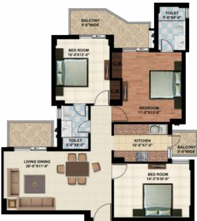
3BHK AREA 1375 SQ.FT TOWER F