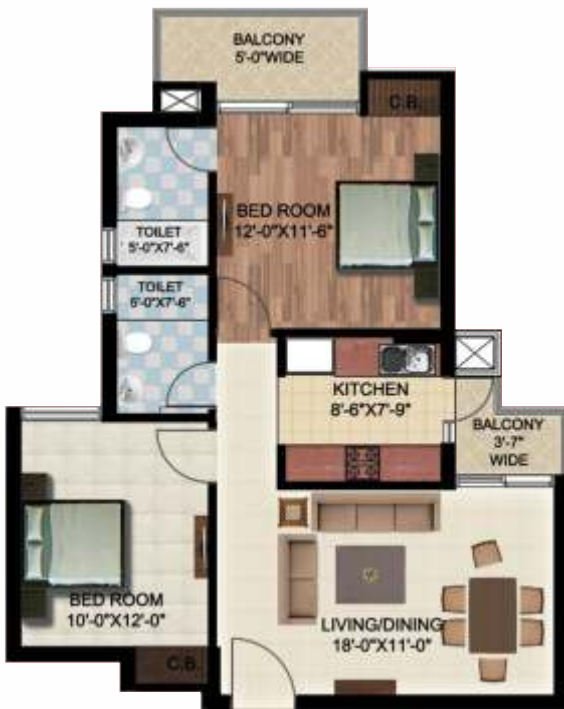
2BHK AREA 1050 SQ.FT TOWER E